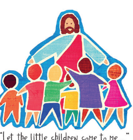
"Let the little children come to Me... Matthew 19:14, NIV

E-books: the quarter's colorful illustrations, Bible stories and Grace Sightings, in ibook and Kindle formats.