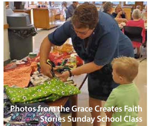
Photos from the Grace Creates Faith Stories Sunday School Class