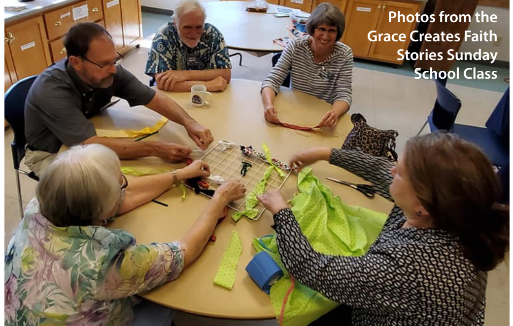
Photos from the Grace Creates Faith Stories Sunday School Class