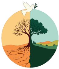
Garden of Peace Isaiah 32:14-18