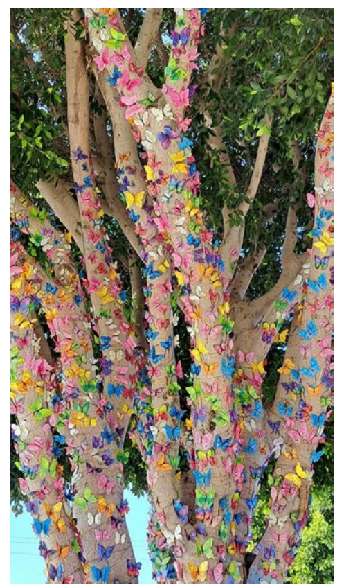
Butterfly Tree, Santa Monica, Calif.

I know a family that keeps and raises butterflies as pets. The parents tell me that, like many things, it all started at their daughter's school three to four years ago when she was given butterfly eggs by a teacher. Since that time this family has become full-on butterfly farmers. They've got the whole setup. Inside the house they have a pop-up butterfly dream condo enclosure. Outside they cultivate native plants that butterflies love, like fennel, milkweed, phlox, aster and catmint.