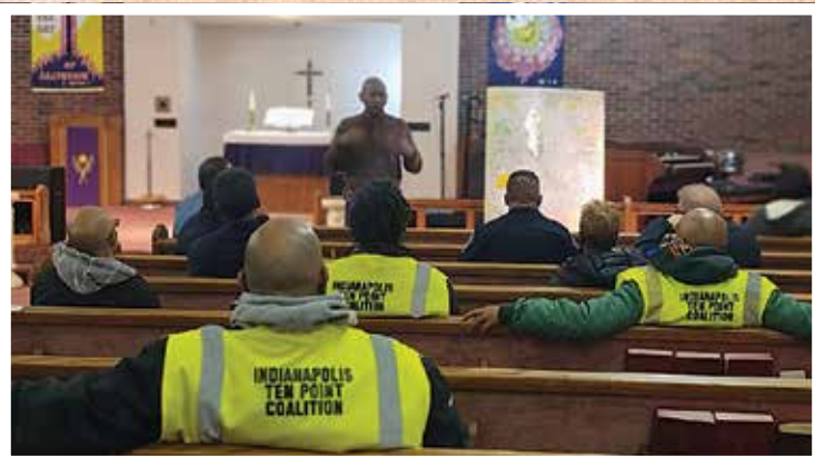
INDY TENPOINT COALITION