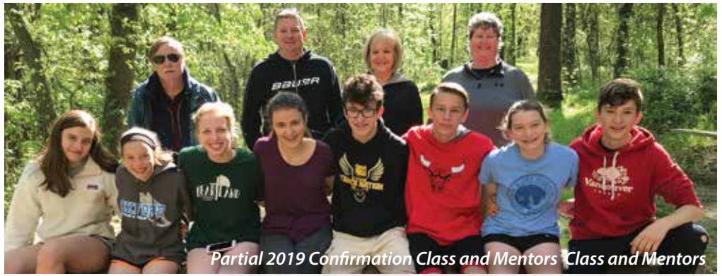
Partial 2019 Confirmation Class and Mentors Class and Mentors