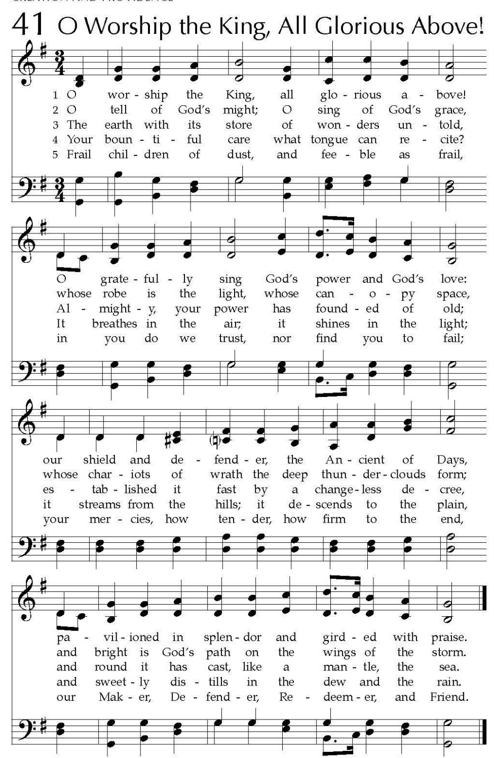
Addressing the first two stanzas to the singers of the hymn and the last three to God, this free paraphrase of Psalm 104 recasts the psalmist's imagery with baroque verve. Though it was first published in England, the tune has been more popular in North America than there.