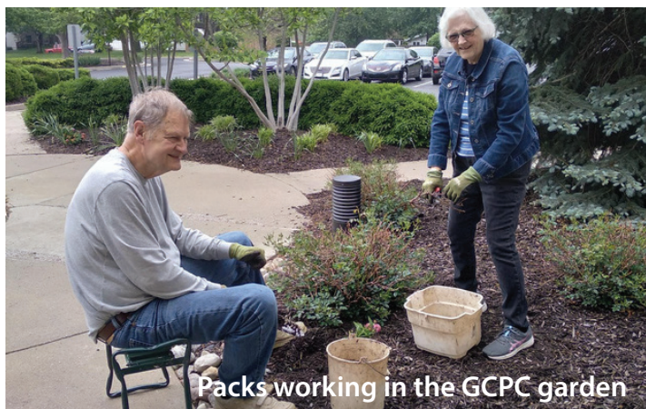
Packs working in the GCPC garden