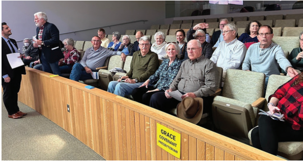
Nearly 30 GPC members turned up at the Nehemiah Action meeting on May 2.