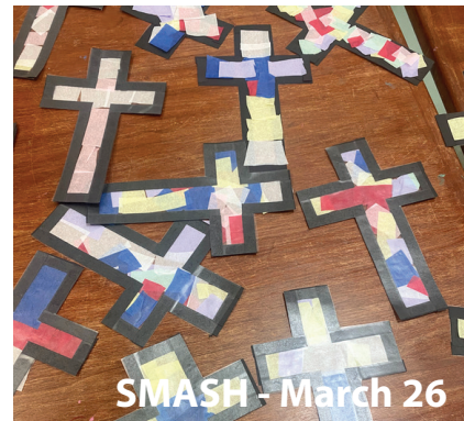
SMASH - March 26