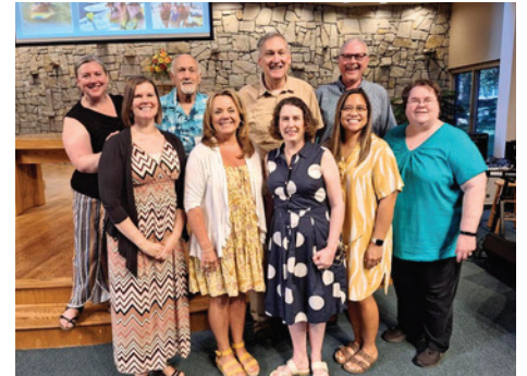
GCPC Praise Team

Details about the 2023 Workshop Sunday can be found on page 6.