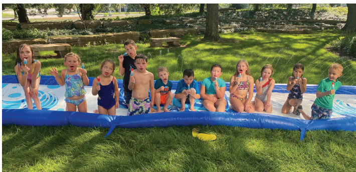
Our GCPC elementary aged kiddos know how to beat this late summer heat. Our SMASH program held its Back to School water play event in August. Splish Splash fun was had by all.

RSVP via our GCPC Children's group Facebook event or email gcpcchildren@gmail.com , and if you would like to volunteer as a helper with SMASH, sign up here: https://www.signupgenius.com/go/70a0a45a4a722a4fc1-smash1# .