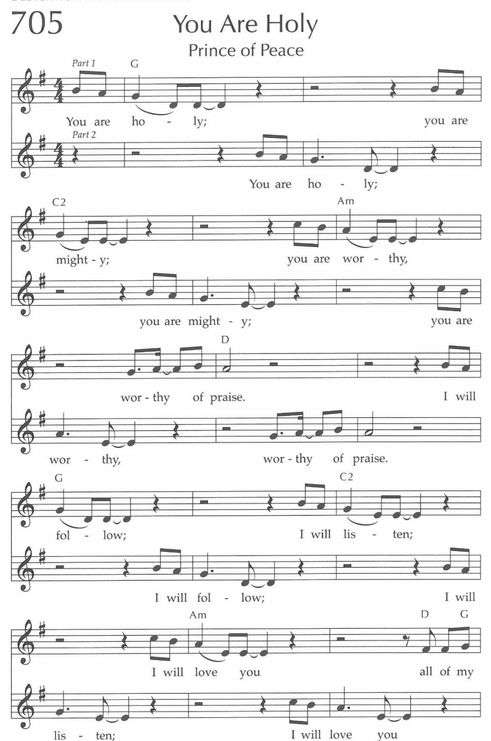
Songs of personal devotion to Christ have long formed part of congregational song, a tradition continued in this contemporary praise and worship song. The two parts suggest the voices of heart and mind, the latter being distinguished by familiarity with many scriptural images.