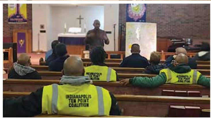
INDY TENPOINT COALITION