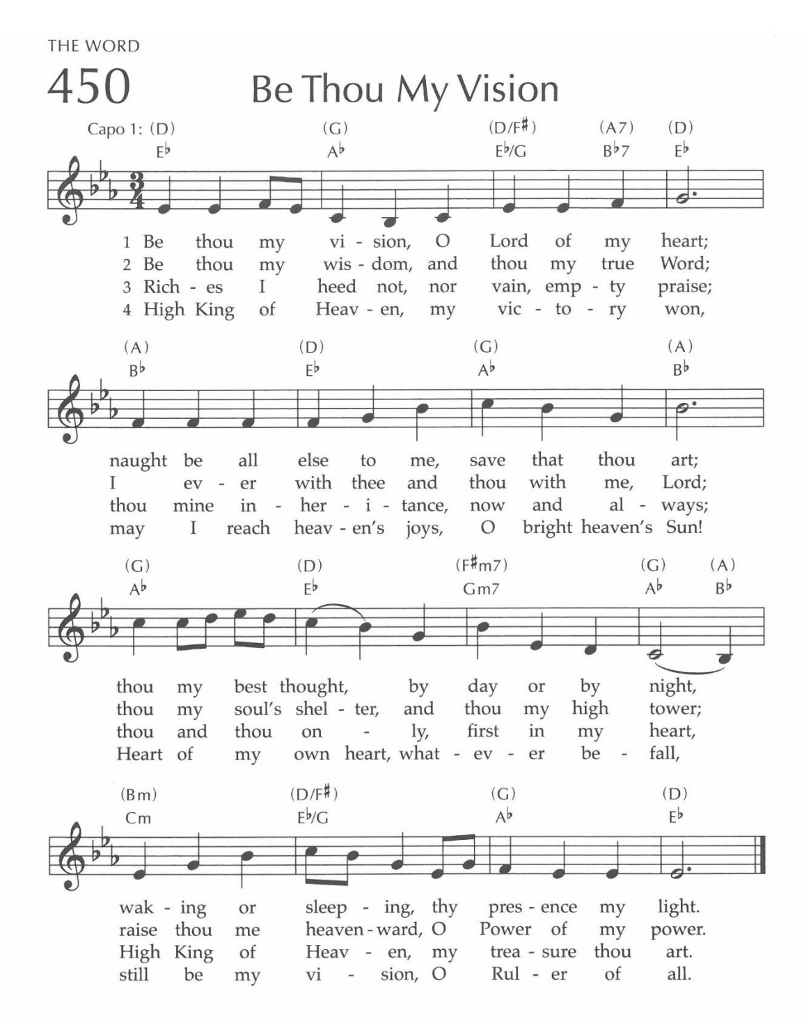
Guitar chords do not correspond with keyboard harmony.

These stanzas are selected from a 20th-century English poetic version of an Irish monastic prayer dating to the 10th century or before. They are set to an Irish folk melody that has proved popular and easily sung despite its lack of repetition and its wide range.