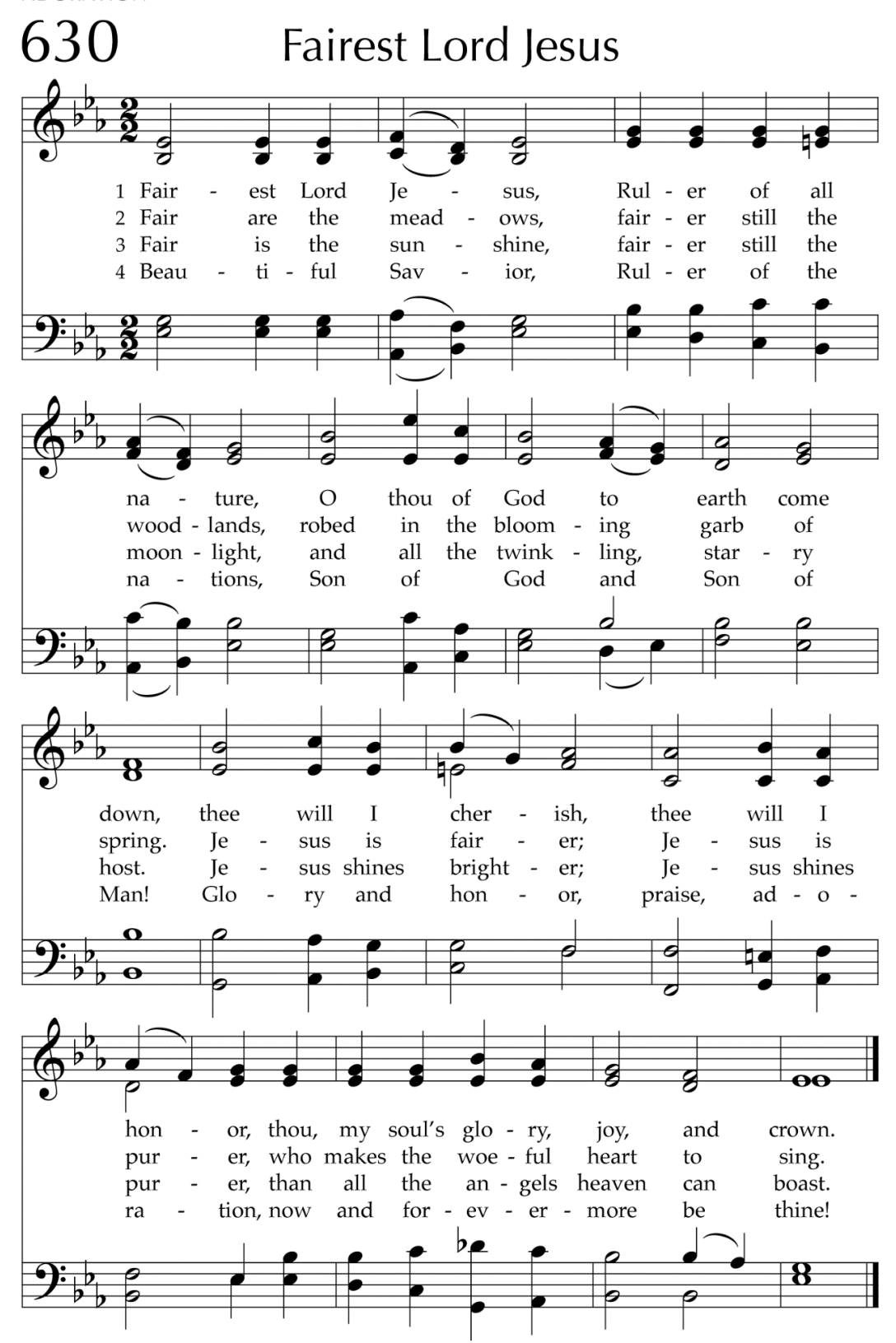
Franz Liszt used this melody for a "Crusaders' March" in an oratorio, but this hymn had nothing to do with the Crusades. No record of the German text exists before the middle of the 17th century or of the Silesian folk melody before the first half of the 19th century.