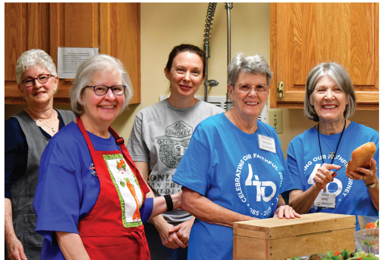
Photo: Kitchen crew on Workship Sunday 2024