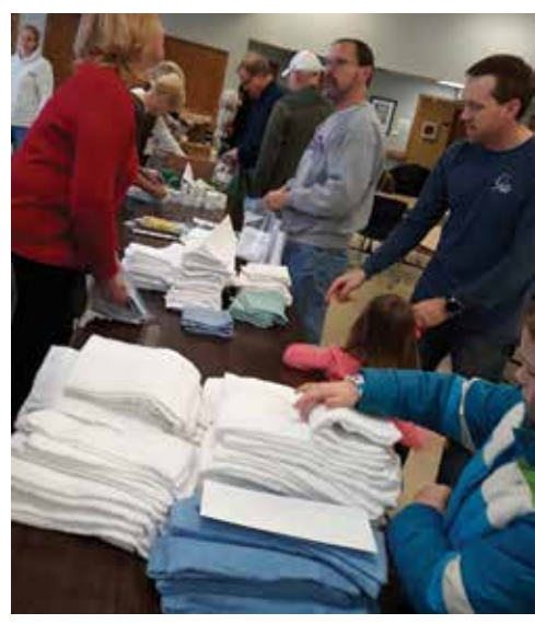
The two photos above are from our Grace in Action event on Saturday, January 26. More details in the March issue.

Our students came from various universities across the United States and are from India, South Korea, China, Japan, Malaysia, and Pakistan. You may have seen some of them at worship on December 23, 24, or 30. Among the various activities planned for the students this year were the Nelson-Atkins Museum of Art, the National World War I Museum and Memorial, Pickleball, volunteering at Thelma's Kitchen, ice skating, bowling, a Western Party, an international potluck, and a New Year's Eve Party. The Western Party included line dances, and square dances. Our Mission Team supported the effort by providing the pizzas. The students embraced the evening activities by wearing "experienced" square dance clothes.