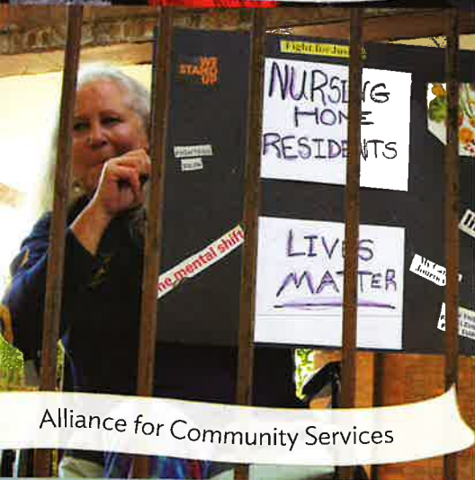
Alliance for Community Services